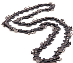
CHAIN LOOP 1/4" .050" MICRO- CHISEL H00-58DL 501 84 40-58