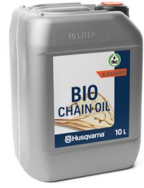
X-GUARD BIO CHAIN OIL | 10 LITRE 596 45 73-03