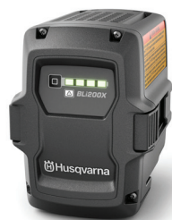
BLI200X BATTERY 970 44 89-01