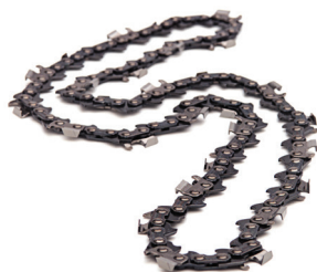
CHAIN LOOP 1/4" .050" MICRO- CHISEL H00-64DL 501 84 40-64