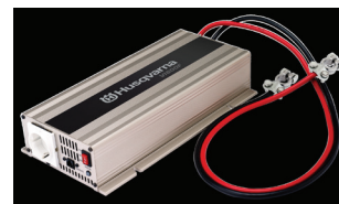
VI600F INVERTER CHARGER 967 62 85-03