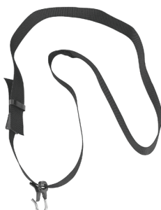
SHOULDER STRAP 537 21 62-01