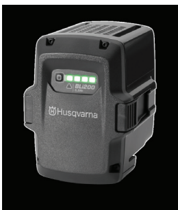
BLI200 BATTERY 967 09 19-01