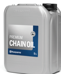
MINERAL BAR & CHAIN OIL - 5 LITRE 579 39 61-01