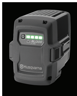
BATTERY BLI300 967 07 19-01