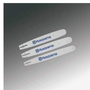
GUIDE BAR 10" 3/8" LP .050" 40DL | MINI BAR MOUNT (A318) 501 82 85-40