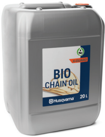
X-GUARD BIO CHAIN OIL | 20 LITRE 596 45 73-04