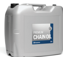
MINERAL BAR & CHAIN OIL - 20 LITRE 579 39 62-01