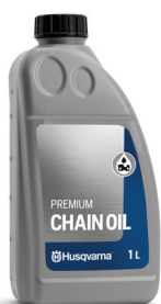
MINERAL BAR & CHAIN OIL - 1 LITRE 579 39 60-01