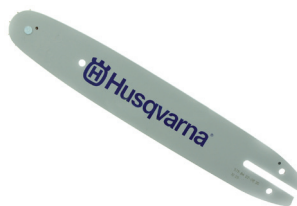
GUIDE BAR 10" 1/4" .050" 58DL MINI BAR MOUNT (A318) 575 84 22-58