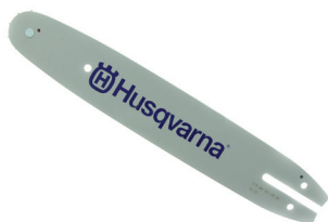
GUIDE BAR 12" 1/4" .050" 64DL MINI BAR MOUNT (A318) 575 84 22-64